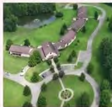
Our Lady Queen of Peace Retreat Center

Christ is counting on you - will you say yes?